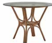
LISSABON ROUND TABLE - 4047A Ø100 H72