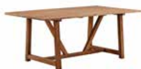
LUCAS TABLE 9472D - L180 D100 H72,5