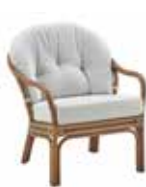
LONDON LOW BACK - 1031A W68 D72 H82 SH45