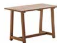
LUCAS DESK 9470D - L110 D60 H73