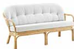
LONDON SOFA - 3031SU W157 D72 H82 SH45