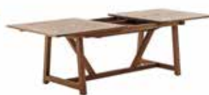
LUCAS EXT. TABLE 9474D - L200 (280) D100 H72,5