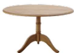
MICHEL TABLE 9452D - Ø120 H72