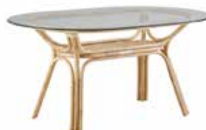
LISSABON OVAL TABLE - 4046SU W150 D100 H72