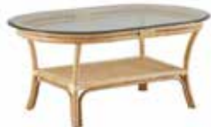
LISSABON COFFEE TABLE - 4038SU W120 D75 H52