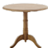
MICHEL TABLE 9458D - Ø80 H72