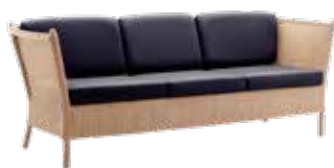
DUO 3 SEATER - 3020U W212 D75 H74 SH45