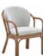
BERLIN CHAIR - 1023A W60 D60 H84 SH46