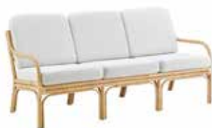
AMSTERDAM SOFA - 3042SU W178 D78 H76 SH42