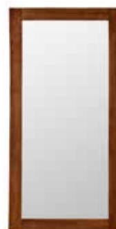
LUCAS MIRROR 4990D - W90 H180