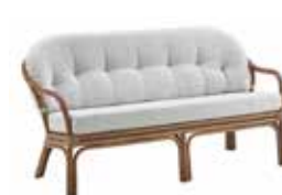
LONDON SOFA - 3031A W157 D72 H82 SH45