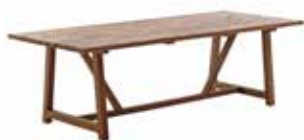
LUCAS DINING TABLE 9444D - L240 D100 H72,5