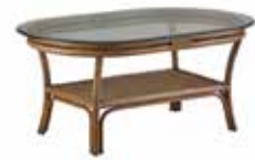
LISSABON COFFEE TABLE - 4038A W120 D75 H52