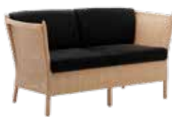
DUO 2 SEATER - 2020U W154 D75 H74 SH45