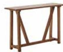
LUCAS CONSOLE 9471D - L140 D40 H90