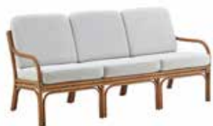
AMSTERDAM SOFA - 3042A W178 D78 H76 SH42