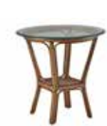
LISSABON SIDE TABLE - 4039A Ø60 H57