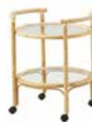
OSLO TROLLEY - 4031SU Ø50 H65