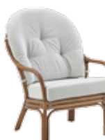
LONDON HIGH BACK - 1032A W68 D77 H105 SH45