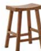
CHARLES COUNTER STOOL 1054D - W50 H68 D40 SH66