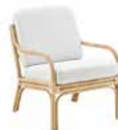
AMSTERDAM CHAIR - 1042SU W64 D78 H76 SH42