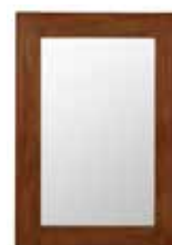
LUCAS MIRROR 4970D - W70 H100