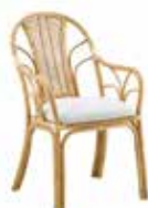
MILANO ARM CHAIR - 1022SU W54 D58 H90 SH46