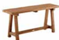
LUCAS BENCH 9222D - L100 D26 H45