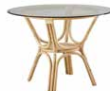
LISSABON ROUND TABLE - 4047SU Ø100 H72