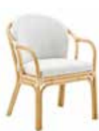
BERLIN CHAIR - 1023SU W60 D60 H84 SH46