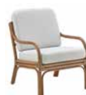
AMSTERDAM CHAIR - 1042A W64 D78 H76 SH42