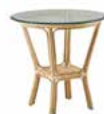
LISSABON SIDE TABLE - 4039SU Ø60 H57