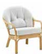
LONDON LOW BACK - 1031SU W68 D72 H82 SH45