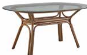
LISSABON OVAL TABLE - 4046A W150 D100 H72