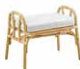
LONDON STOOL - 1030SU W66 D45 H50 SH42