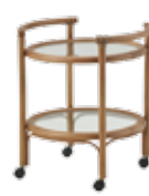
OSLO TROLLEY - 4031A Ø50 H65