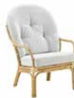
LONDON HIGH BACK - 1032SU W68 D77 H105 SH45