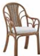
MILANO ARM CHAIR - 1022A W54 D58 H90 SH46