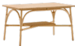
DUO COFFEE TABLE - 4020U W100 D60 H62