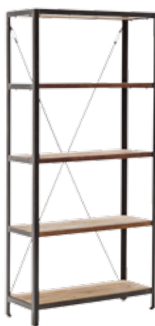
SHELLY SHELVES 4055D - W100 D40 H211