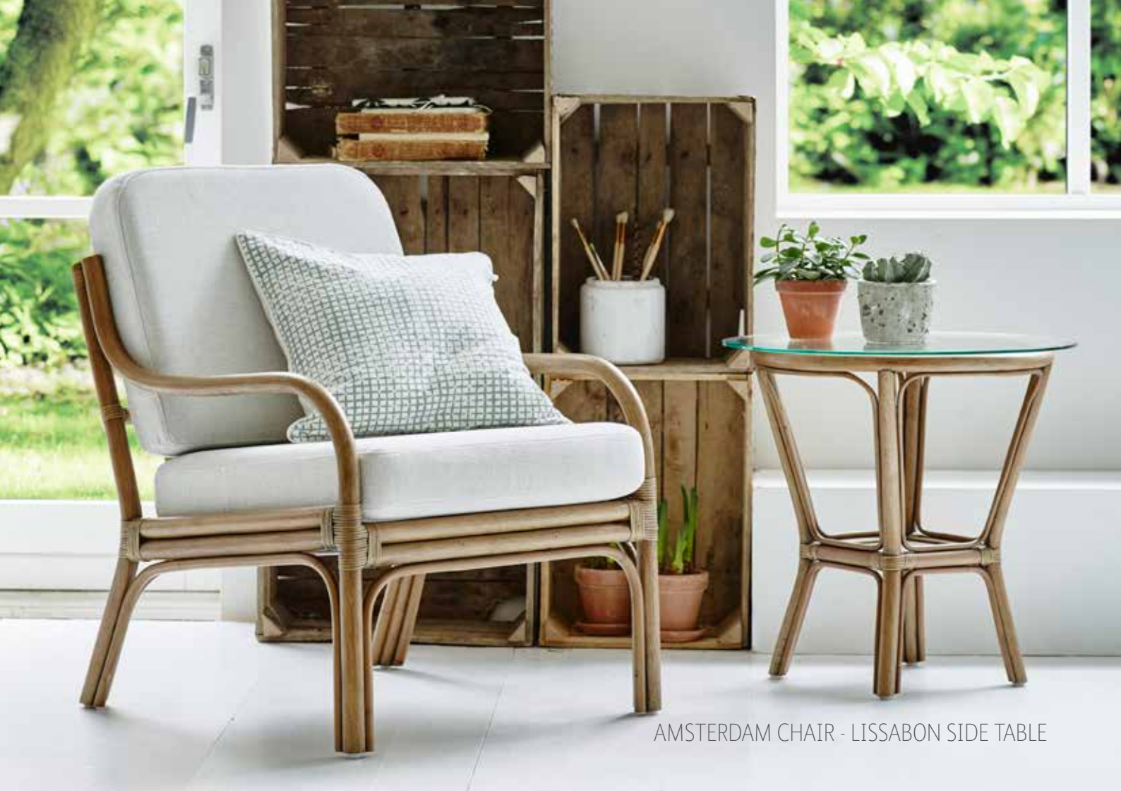
AMSTERDAM CHAIR - LISSABON SIDE TABLE