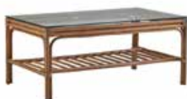
NICE TABLE - 4045A W122 D72 H52