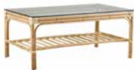
NICE TABLE - 4045SU W122 D72 H52