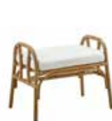
LONDON STOOL - 1030A W66 D45 H50 SH42