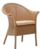
CLASSIC CHAIR - 1072U W67 D61 H81 SH46